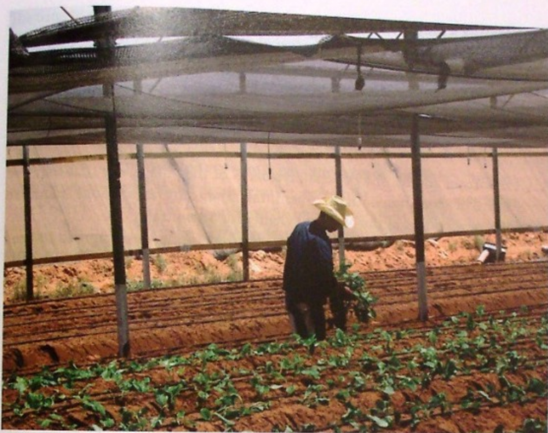
Plants are picked and potted for export

After the flower reaches the appropriate level of growth, it is transferred to the plot of land where the flowers will develop until their final stage. At this stage, he cuts the seedling, removes its leaves and then plants it in the ground.