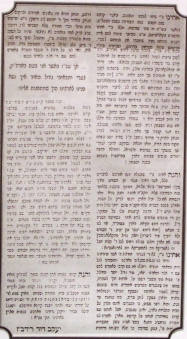
The Kuntrass on Shemittah from the Radvaz